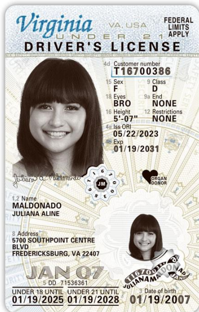
Virginia continues to issue vertical licenses to minors

Individuals who apply for a new, renewal, or replacement Virginia license or ID card will receive a credential in the new design. Credentials in the previous design will remain valid until their expiration date.